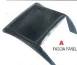
A FASCIA PANEL